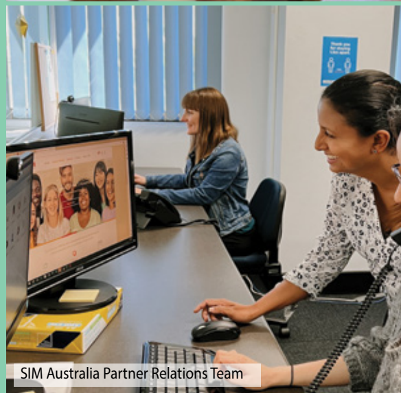
SIM Australia Partner Relations Team