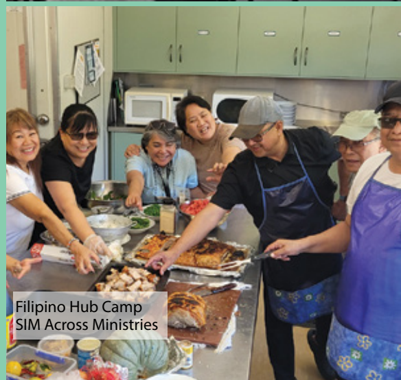
Filipino Hub Camp SIM Across Ministries