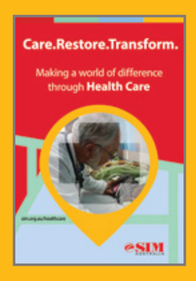
Health Care Opportunities

You can request these brochures by visiting sim.org.au/skills