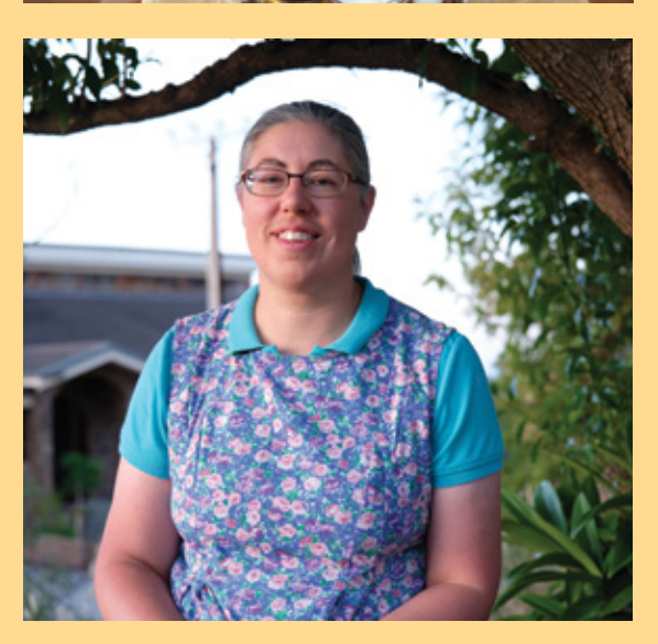
PRAY: Join us in praying for those who are preparing to serve overseas with SIM.

GIVE: Do you want to financially support the mobilisation of skills-based mission workers? Give to the 'Mission Global' Fund (003000) by filling in the form on the back page or by visiting sim.org.au/missionglobal.